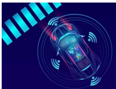
Figure 1: Advanced technologies for autonomous vehicles

it is the primary mark of call, in that the last choices of any av are all around as great as this boundary