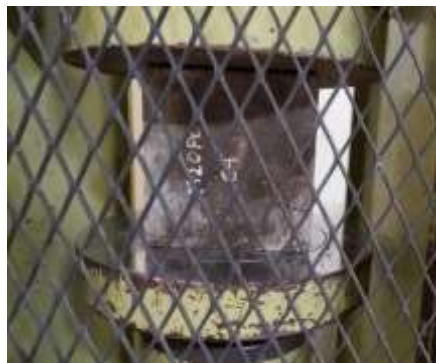
Figure: Compression strength test

The size of the cube is 150 X 150 X 150 . The test has been done for 28 days. The obtained result is compared with conventional concrete and concrete along with glass fiber, steel fiber and polypropylene fiber.