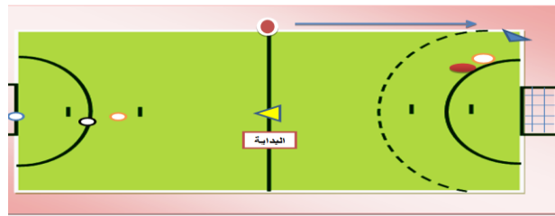
Figure (1) illustrates the way the test is performed

Tools: 10 hand balls, a handball field, a handball goal, rubber ropes as shown in the figure below, adhesive tape, a measure tape, registration form, recorder..