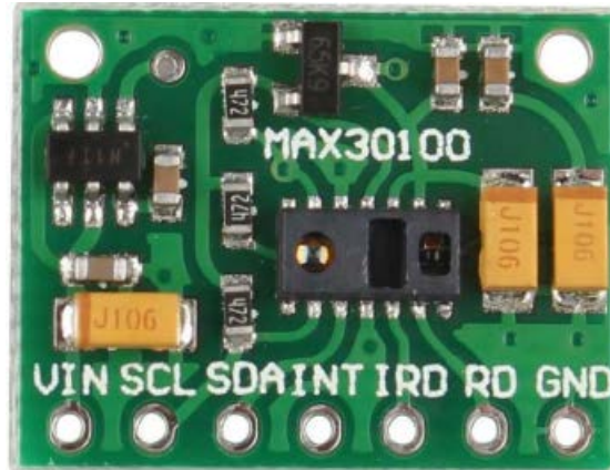
Figure 2: Pulse Oximeter Sensor Module

monitoring patients in critical care. It helps monitor the patient's heart rate and pulse oximetry – a test to measure oxygen saturation level in the patient's blood [16].