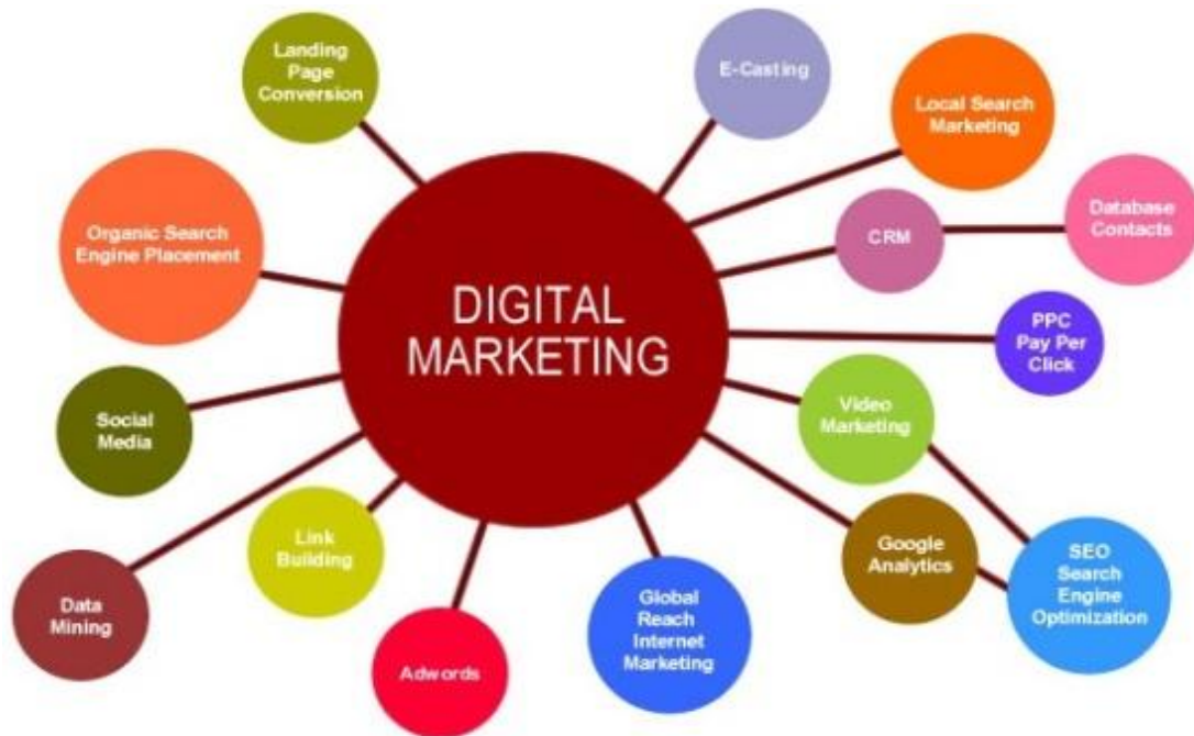
Fig.1: Digital Marketing

Additionally, net offers some valuable selections for reducing the value of the various marketing strategies that's becoming further necessary among the presence of world-wide finical and financial condition. The main analysis focus of this piece of writing is prepared on work recent trends and developments in net marketing. The appliance of net as fully totally very distinctive business tool created completely new approaches for doing business referred to as net or on line marketing.