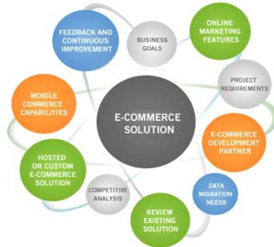
Fig.2: Online shopping Carts