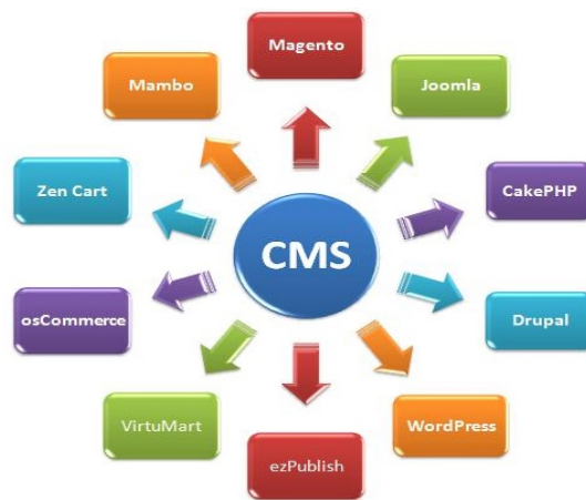
Fig.1: Content Management System

In the planned system, as discuss inside the abstract we tend to stand live planning to develop the new site on-line searching System for laptop product. inside the online website, I followed the package development methodology referred to as progressive approach nicotinamide urine dinucleotide per it the system is mainly divided into 2|the 2} styles of users and two forms of mechanisms to create further appropriate for the tip users to satisfy their all necessities from one place with quick and in further comprehensible manner. Here 2 forms of user's area unit Admin and user suggests that shopper.