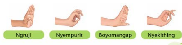
Figure 2. Hands moves

The hand moves which are observed in this study are: