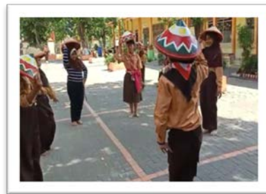
Figure 8. Moves construction

The body parts that students move look aesthetic and attractive. During the activities of dance learning, students set moves, arrange moves, and combine moves into a set of moves in harmony with the supporting elements of dance performance.