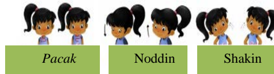
Figure 1. Head moves

Head and neck move in dance are such as pacakgulu , nodding, and shaking. The moves are presented in the following figure.