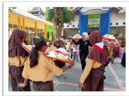
Figure 6. Students' Moves

The result of observing dances is then practiced together with other students. Each student is able to practice the moves based on the observation, both from pictures and videos. Students are able to create dance aesthetics, composition of works, and creating the beauty of property, make-up, costumes with very good results. It can be seen that students are able to show aesthetic moves using power technique based on the needs and theme. The moves found and practices are varied, including the counting, power, and feeling in the moves. The variety of moves in counting is counting one to eight produces 1 move, counting one to eight produces 2 moves, counting one to eight produces 3 moves, counting one to eight produces 5 moves, counting one to eight produces 5 moves, counting one to eight produces 6 moves. The moves implement dance characteristics such as wiraga , wirama and wirasa . The students' moves can be seen in the following figure.