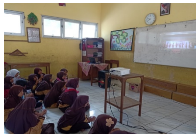
Figure 5. Students do observation

The activity of students' observation is presented in the following picture.