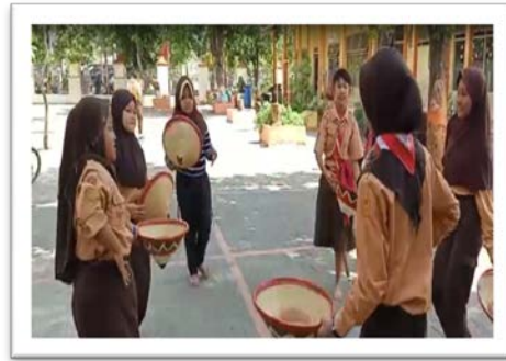
Figure 7. Dance Exploration