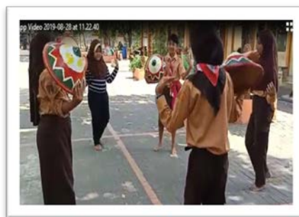
Figure 9. Moves creativity

Students' creativity can be built well, this can be seen from their development since the very first step of simple moves of body parts such as leg, hands, body, and head. Moreover, the moves are developed and practiced further. The moves are practiced in place then in another place. Furthermore, the students are filling the space including the direction, tempo, level (high-low), and rhythm. The second one is through music stimulation which is responded by creative moves.