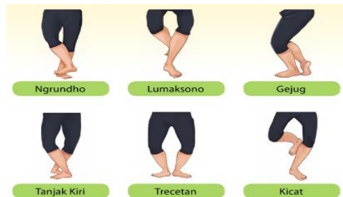
Figure 3. Leg moves

Leg moves in dance consist of several moves such as jinjit , ngrundho , and lumaksono . The types of leg move in dance are as follows.