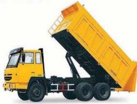
Fig: Existing Model of Dump Truck