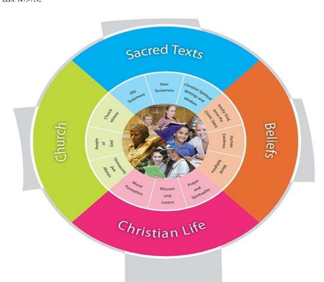
Figure 2: Structure of Religious Education