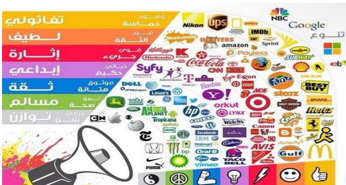
Figure (1) Sensory evidence of colors

exchange between tourism organizations and the target segments of the Declaration and shows (Figure 1) the following important dimensions in the psychology of colors and their impact on humans.