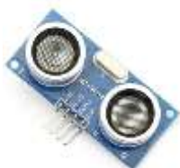
Fig. 1. Ultrasonic sensor

We use four ultrasonic sensors to measure the density of traffic of each road respectively, they can be placed on the road with respect to user's choice. These four ultrasonic sensors are connected with ATmega328 controller which will check each ultrasonic sensor and with respect to data collected from all the ultrasonic sensors, it sends command to Atmega328 controller to change timing of lights. When traffic reach to ultrasonic sensor then sense the presence of vehicle, and if vehicle stay