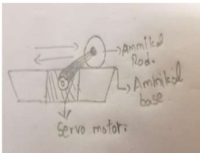
Figure 1 connection between the servo motor & ammikal

The arduino is the chip placed under the ammikal for our convenience the Arduino the figure is shown below. Fig 2 shows the placement of Arduino.