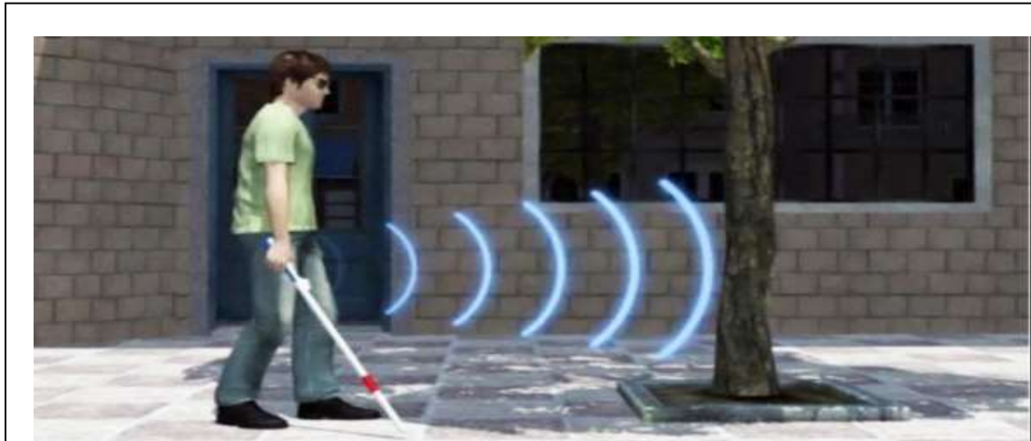
Figure 2: Ultrasonic working

In several experimental experiments, the device has been used. A blind person was examined for the first field study of the road preparation. The research routes were approximately 100 meters wide.