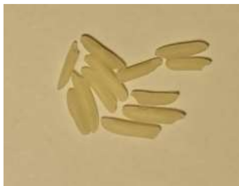
Fig (i)Rice sample

Use different rice samples as example and check the quality of the rice using cnn algorithm which is proposed in this paper,for example consider the following rice sample the output of the rice sample for quality checking is as follows: