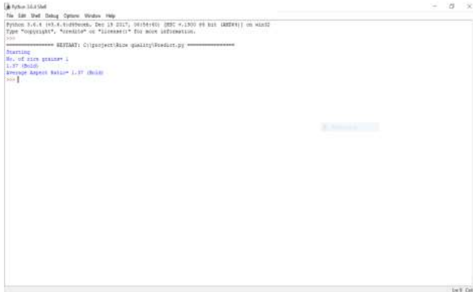
Fig(ii) running the CNN algorithm in python to check the rice quality