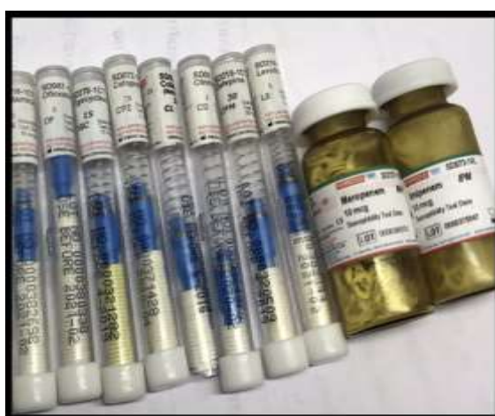
Fig 1: Antibiotic discs used.