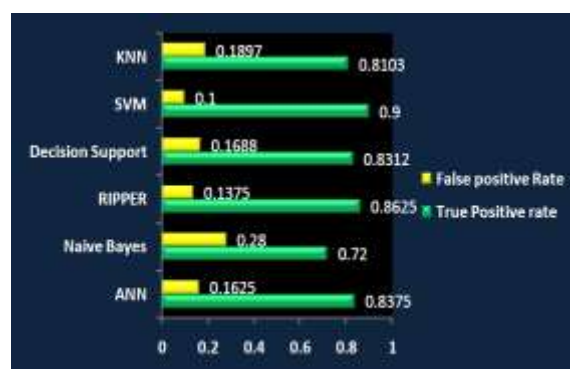
Figure 3: It shown that the SVM gives higher true positive rate compared to other algorithms.