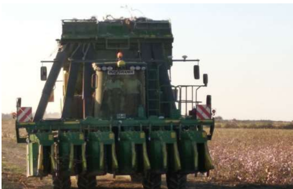
Figure 2: JohnDeere is a cotton picker

These innovative cotton pickers were tested for the first time by Indarama, a Singaporean company, in the Akaltin district of Syrdarya region.