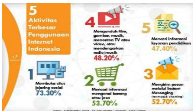
Figure 2: Online Media Usage Activity in Indonesia in 2018

Figure 1.1 above shows that teens including active users using the internet. This would require special attention to providing knowledge to young people in using social media trauma impact of cybercrime and hoaxes and literacy to young people to be able to have communication mediated social behavior to minimize anxiety in adolescents who are active in the use of online media. Based on the data obtained from https://www.validnews.id/Menyoal-Perilaku-Anak-Terimbas-Media-Sosial-Aza ) States that there is five biggest activity of internet users in Indonesia which can be seen in Fig.1 below: