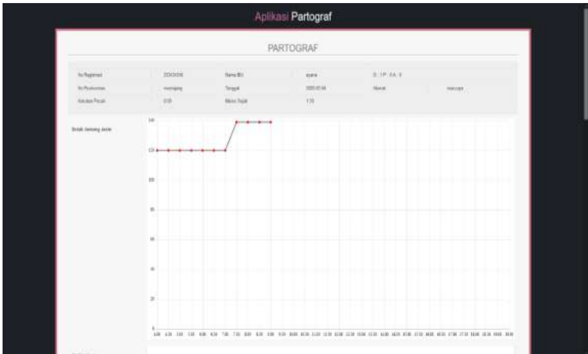
Picture 3. Digital Partograf