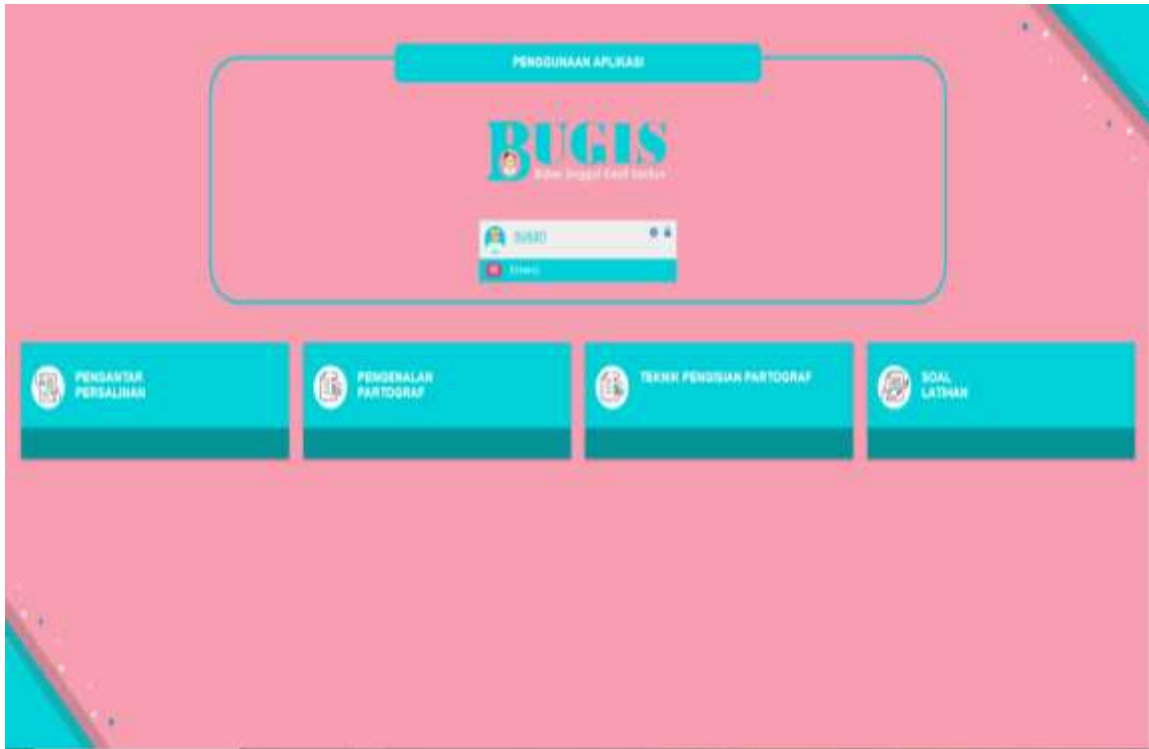
Picture 2. Application Figure