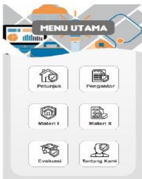
Figure 2: Display of Main Menu Vocation Based Mathematics E-Module

Some features in main menu are (1) direction feature contains information how to use e-module mathematics based on vocation; (2) introductory feature contains the background information, advantage of e-module, title of main discussion and thank-you note; (3) feature material 1 and 2 contains about main discussion and the assignments for students; (4) evaluation feature contains examples to measure the learning outcome; and (5) feature about the contact person and identity of e-module.