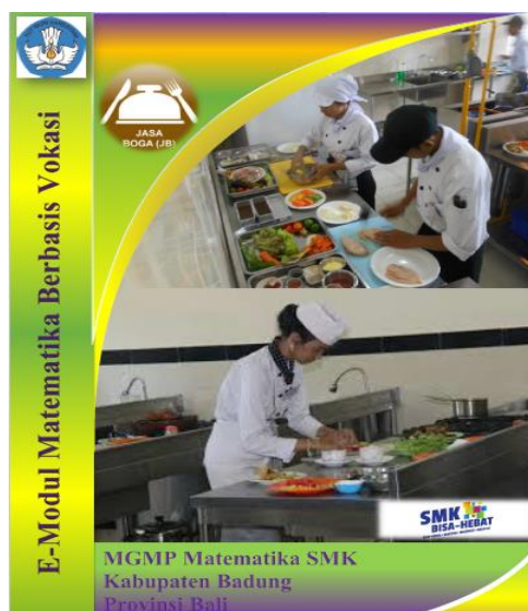
Figure 1: Display of Cover Page of Vocation based Mathematic E-Module

In prototyping stage was developed e-module mathematics based on vocation according to the studies found in preliminary research stage, the prototyping result named draft 1. In figure 1 and 2 is showed the cover page and main menu of vocation based mathematics e-module.