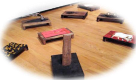
4.A Mixed Media