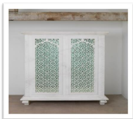
2.A Sunset (2010)

With the use of science, technology and thoughtful material use, artist is engaging with new dialogues through their works. And Subodh Gupta is the best example of art and technology. His work has deep relation with technology, because he is experimental in nature. He loves to work with different medium, so he needs to follow number of techniques too for making art works. He is well known with traditional style as well as modern techniques, a master of both depending on the demand of work. Every single work shows shadow of different techniques used by him. And most of his work is on huge scale and without right technology it can't happen. The choice of right technology with medium is the result of well-known art works among all. For instance, Sunset (2010) is a wardrobe, in which blend of both traditional as well as modern techniques can be seen, made up of hand-carved marble, referencing the traditional skills and craftsmanship associated with Mughal Empire in India. Another example is Dada (2013) a banyan tree, composed of more than one technique. A tree made up of stainless steel with traditional style and ready-made utensils can be seen on its branches as leaves. Subodh Gupta's number of work shows blend of variety of techniques which leaves an awe-inspiring impact on viewers.