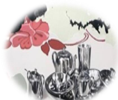
3.B Oil and enamel on canvas