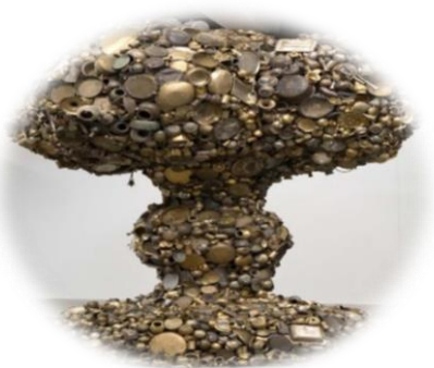
3.A Brass and copper utensils

Today art has different aspects. And very beautifully artists trying to show the connection of art with other subjects. Subodh Gupta's work is pleasing of this inter-connection. For example, 'Line of Control' (2008), a colossal mushroom cloud constructed entirely of pots and pans. In this sculpture he welds one pots or pans to each other and even length breath height must be kept in mind before constructing such a huge sculpture. This sculpture is example of involvement of three different domains for one work and different domains are maths, mechanical engineering and arts. Painting series 'Still Steal Steel' consists of photorealistic paintings of kitchen utensils falling and moving in space, this only happen because of involvement of technology in art. In his performance 'Pure' (2000, 9 mins), Gupta takes the concept of purifying literally and has filmed himself taking a shower to free himself of the thick layer of dung that covers his body. Making or recording of performance is possible because of technology. Installation 'Across the Seven Seas' (2004) where he uses baggage trolleys of modern airports to allude to the grim historical reality of migration from India. Creating installation is not possible with limitations in boundaries of art, it requires other domains too. Technology plays a vital role in his work. Both art and technology can be seen in his work. His work always has some hidden stories behind them, which he aesthetically describes to public.