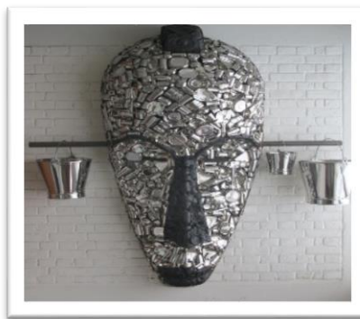
1.B Black Skin White Skin (2011)