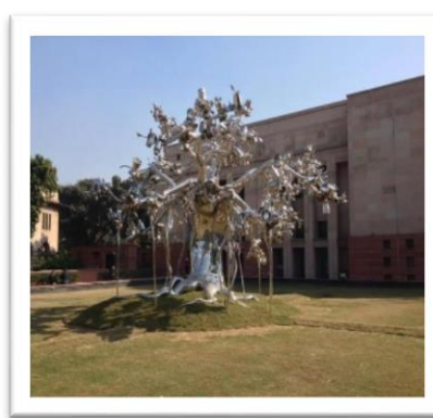
2.B Dada (2013)