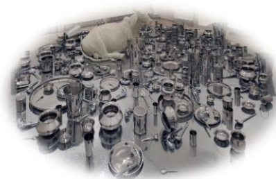
4.B Mixed Media