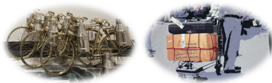
4.C Bronze and Chrome