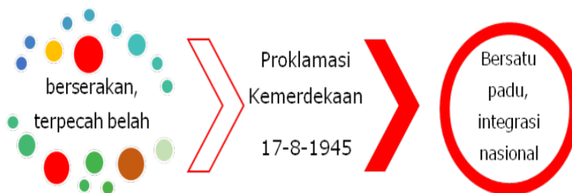
Figure 1: Proclamation of Indonesian Independence is a process of integration of the Indonesian Nation (Team, 2016: 69)