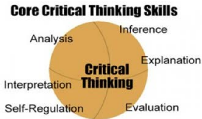
Figure 1: Critical thinking

Critical thinking involves conceptualizing the data, applying the data as problems arise, breaking down the data and integrating it before making a final decision. It's just after that that there can be an obvious end result. Unfortunately, this needs the information age as answers are generally and promptly accessible and there is no push to check the source or even think about the data.