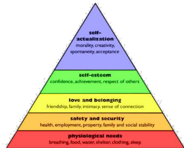
Figure 1: Maslow's Need Hierarchy (Maslow, 1965)

Maslow's theory is distinguishing to theories of motivation in two concepts which are deprivation (an unsatisfied need) and gratification (a satisfied need). Those two thoughts determine the behaviour. The deprivation (an unsatisfied need) present in negative response and gratification present in positive reaction. The five-level of needs based on Maslow's theory is divided into two levels, which are deficiency needs or D-needs and being need or B-need. The deficiency needs or D-needs include all four levels, at the deficiency, needs human will not feel satisfied unless they were deprived. In addition, once they feel confident at the previous level, the feeling of deprivation will appear to the next level. On another hand, needing or B-need which include the last level, which is called Self-actualisation, it is the final level that the employees can reach, within feel full motivation and satisfied (Smith, 2003). A cycle of motivation, support employees to be satisfied with their work, is ongoing and never reach ending beside it is varied, complex and fluctuating. Thus, theories of human motivation should be aware of it (Smith, 2003; Upadhyaya; 2014; Osman et al., 2017)