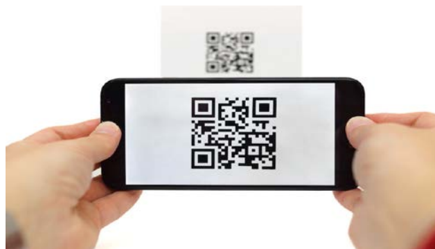
Figure 2: Example of QR Code

QR Code can provide fast and connected reactions with all the required data, it can be in the form of URLs, text, videos, email addresses, VTs, 2-dimensional displays to look really alive including presenting video learning material for organizing bodies. QR Code is black square-shaped like a barcode but with a more concise appearance. Here is one example of QR Code: