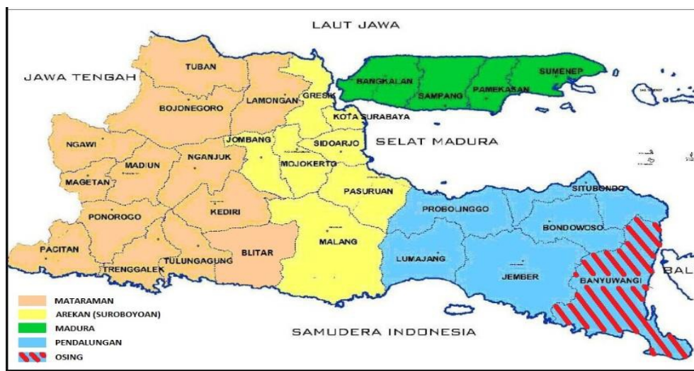
Figure 1: Local Community Group Map

Other groups of potential voters who would be better approached by direct meeting included those residing in Pandhalungan, which covered the area of Pasuruan, Probolinggo, Situbondo, Bondowoso, Lumajang, and Jember. Geographically, they were located in the eastern end of the Island of Java, but culturally and ethnically, they belonged to the Madura ethnicity. This meant that, in terms of religion, they were Moslems and were very obedient to the preachings of their ulmmas. The following map shows the division of the province by local community groups.