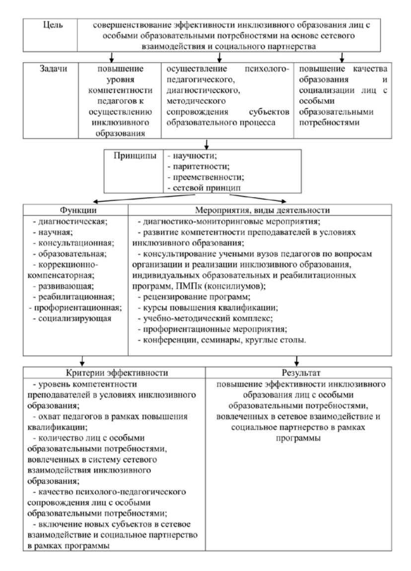
Figure 2. Structural-functional model of network interaction and social partnership

To this end, we have developed a program of scientific and practical training of teachers in the framework of the inclusive educational environment "Networking and Social Partnership", the purpose of which is the creation of collegial support (regulatory, organizational, substantive, educational, psychological, pedagogical, etc.) for students, employees and university professors in the process of training students with special educational needs of various nosological groups (Figure 2). It is not so simple to create a full-fledged effective mechanism of organizational interaction in an inclusive environment, since in the current period inclusive educational practice is quite limited and largely experimental. A certain detachment from the problems of people with disabilities, which we can observe in our time, only speaks of the lack of awareness of such problems.