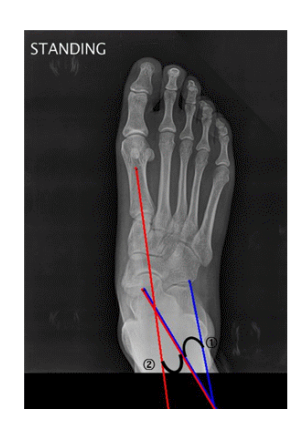
Figure 3: Antero-posterior foot alignment ①Antero-posterior talocalcaneal angle② Antero-posterior talometatarsal angle