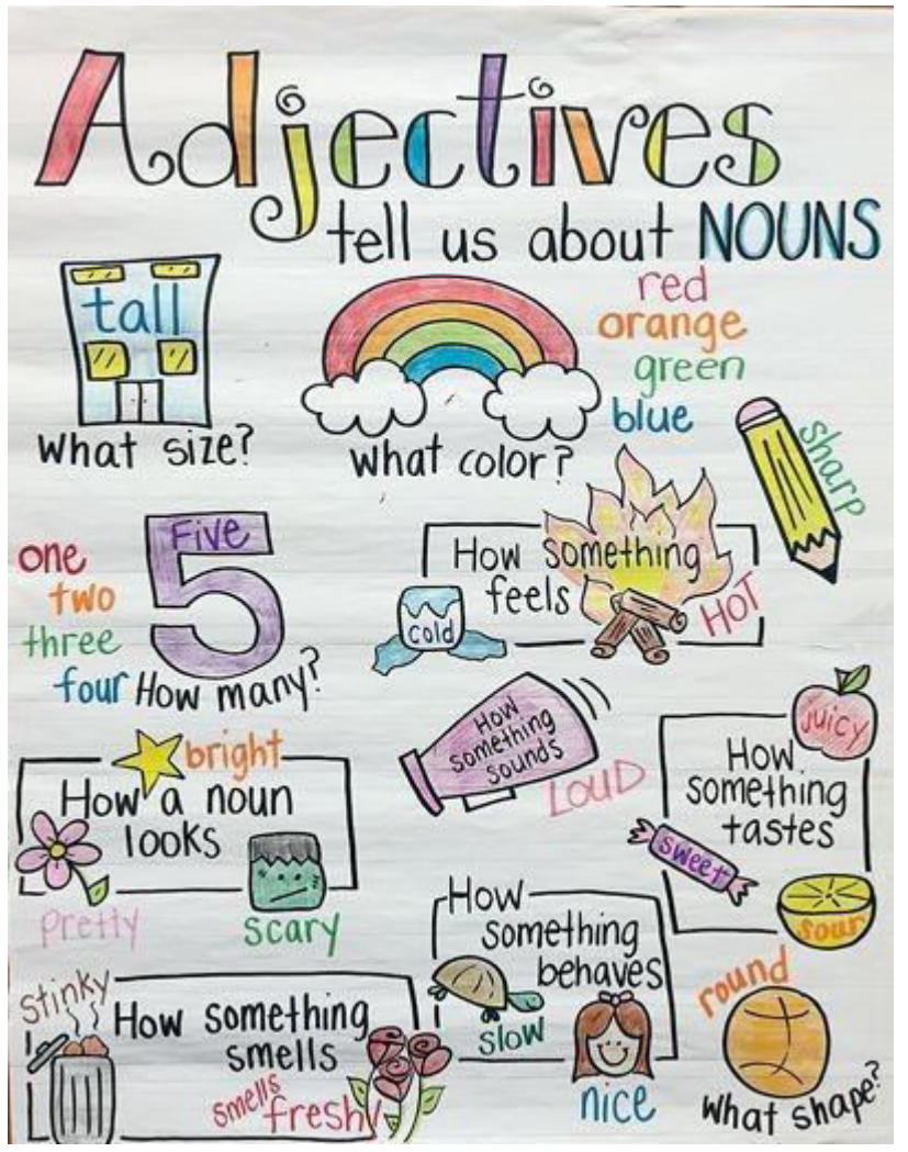
Fig.2 Snapshot of the chart work done by team 6.