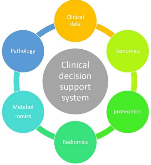
Fig 1. Components of CDSS

Pharmacy Decision Support Systems (PDSS) represent a critical component of contemporary healthcare informatics, designed to augment the decision-making processes in pharmacy practice and improve medication safety. This section provides an in-depth exploration of PDSS, shedding light on their functionalities, components, and significance within the healthcare ecosystem.