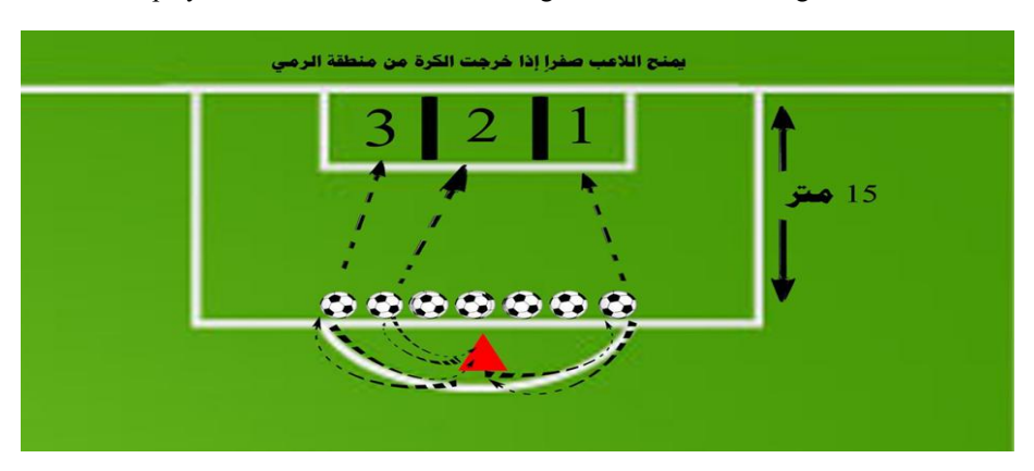
Figure (2) illustrates the scoring skill test