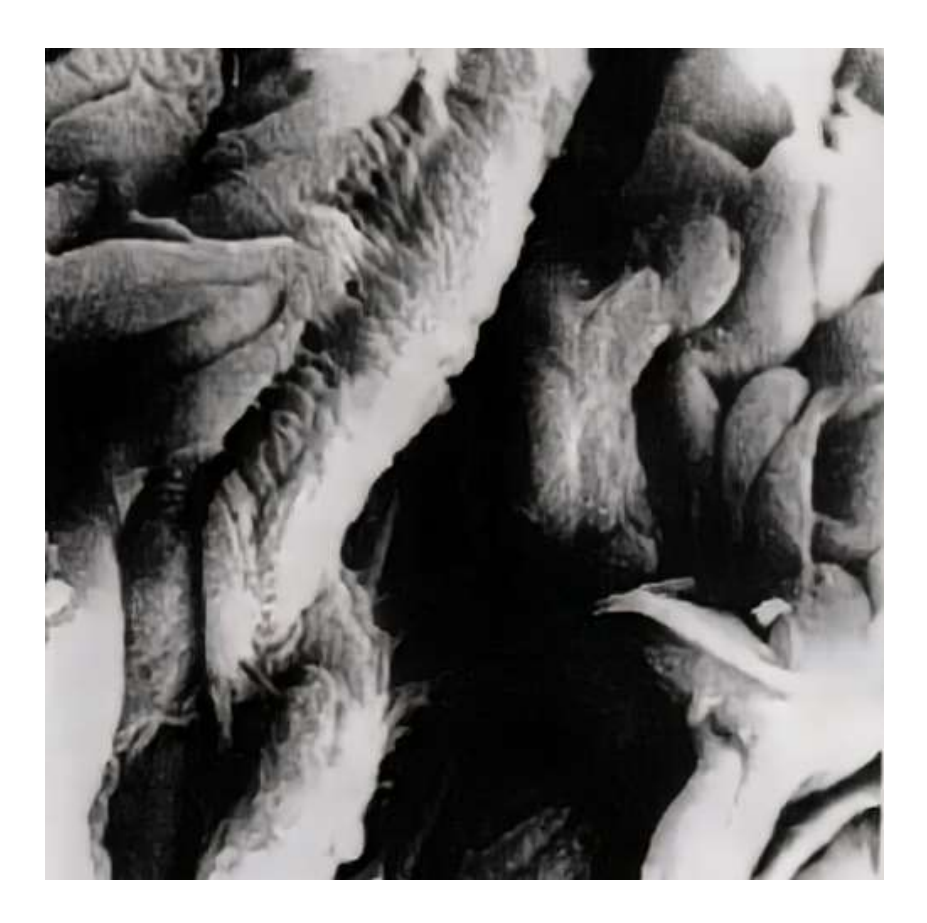
Figure 1. Central Asian salamander (Ranodon sibiricus). X 1600

In caudate amphibians living in mountainous areas (Central Asian salamander (Ranodon sibiricus)), a decrease in the number of mucous cells, a decrease in the secretion of surfactant, a thinning of the airborne membrane system, and an increase in the area of the respiratory tract was observed. Scanning microscopy results showed an increase in the area of the respiratory surface [12].