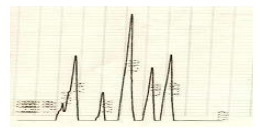
Fig. 2: HPLC Analyses of Isolated Flavonoids Extract from Arctium Lappa Stems

The result indicate that the types of flavonoids in isolated flavonoids fraction from the plant stem indicate 607.73 \mu g/g of rutin, 363.35 \mu g/g of Myrecetin, 720.26 \mu g/g Quercetin, 502.44 \mu g/g Apigenin and 637.96 \mu g/g Kaempferol, with two unknown pecks[table3].