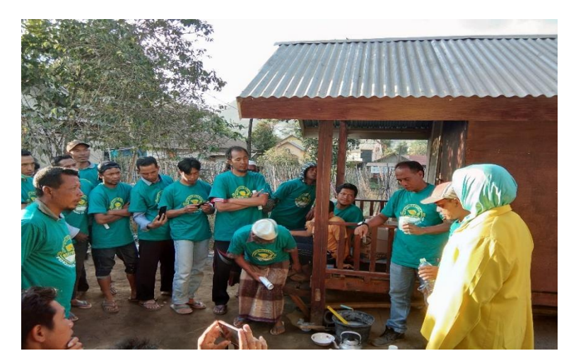
Figure 2: Training of making liquid organic fertilizer from the regional potential and community activities waste in Sembalun.

The enthusiasm of respondents in this program was quite high, they not only pay attention but also record independently the whole process of making liquid organic fertilizer that is shown. They are even interested in making their own liquid fertilizer (Fig. 2).