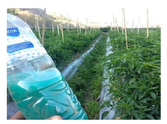
Figure 3: Condition of chilli plants that are given liquid organic fertilizer.

The application of liquid organic fertilizer made by respondents was done on the chili plants which they planted. Chili is one of the commodities that widely grown by respondents besides garlic and potatoes. The first application is done 3 days before planting, then the application is done on 7-14 and 21 - 35 days after planting. The dose of the solution used is 100 mL-200 mL added to water until it reaches 14-15 L. So far, the application of fertilizer has had a positive impact on chili plants. The plants do not show any symptoms of nutritional deficiency or toxicity such as chlorosis and necrosis (Fig. 3).