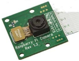
Figure 4: PI CAMERA