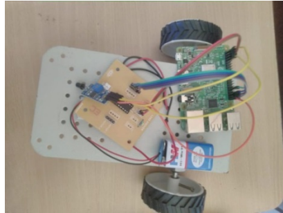
Figure 6: Prototype model