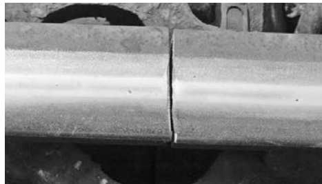
Figure 7: Sulur railway track smashed