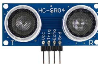
Figure 3: ULTRASONIC DISTANCE SENSOR

For ultrasonic closeness sensors an exceptional ultrasonic transducer has been used, that reflects a propagation for Synchronization or sound wave collection. An object represents the acoustic frequencies emitted by both the transmitter which recovers within the waveguide. When the sound waves are emitted, the ultrasonic sensor is adjusted to either get operation. The time was spent between developing and embracing correlates to both the sensor range of the object.