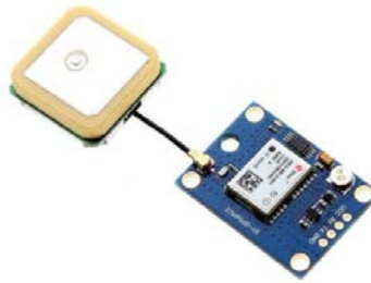
Figure 2: gps

The L10 Compass kit offers the monetary standard for MTK superior locating engine. The L10 supports 210 channels in the PRN. 66 Hunting Stations and 22 synchronous following stations, this gets signals and records them within the deadline especially in the summer. In adaptable, freelance collector consolidates an intensive cluster of highlights with adaptable availability alternatives. An electrical transmission line is a distributed parameter network [11]. Their straight forward coordination prompts quick time-to advertise during a wide determination of car, shopper and modern applications.