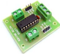
Figure 5: MOTOR DRIVER (IC)

L293D could be a regular motor driver or servo motorist IC licensing the DC motor in any direction. L293D might have been a 16pin IC that can monitor all the way to any direction whereby the dual DC engines are mounted. This means that you will control two L293D IC DC Engines. Dual H-connect driver in engine Circuit incorporated (IC). An engine driver might be a little ebb and flow intensifier; the capacity of engine drivers is to require a low-momentum control signal at that point transform it into a higher-ebb and flow signal which will drive an engine.